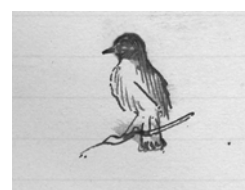
I saw a stonechat